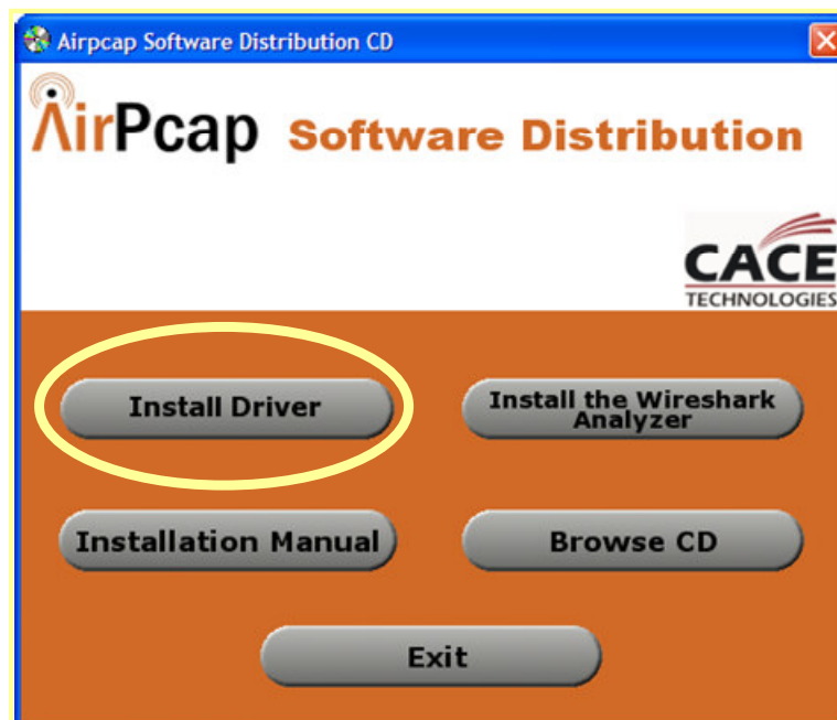
Figure 1: The CD Setup Page – Install Driver.