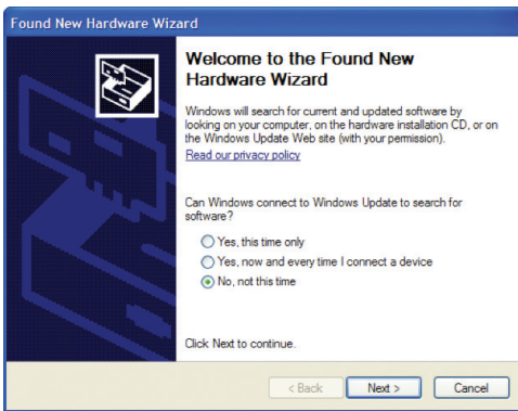
Figure 2: Found New Hardware Wizard

Depending on the operating system version, when you plug the adapter in for the first time, Windows may show the “Found New Hardware Wizard” (Figure 2).